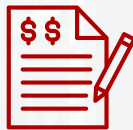
Chief Financial Officer