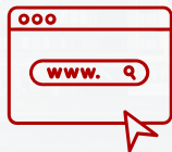
Head of Website Development

The Halifax Helpers added three new executives to the board: